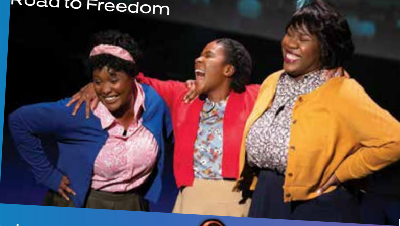
Turning 15 on the Road to Freedom