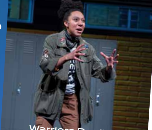
Warriors Don't Cry