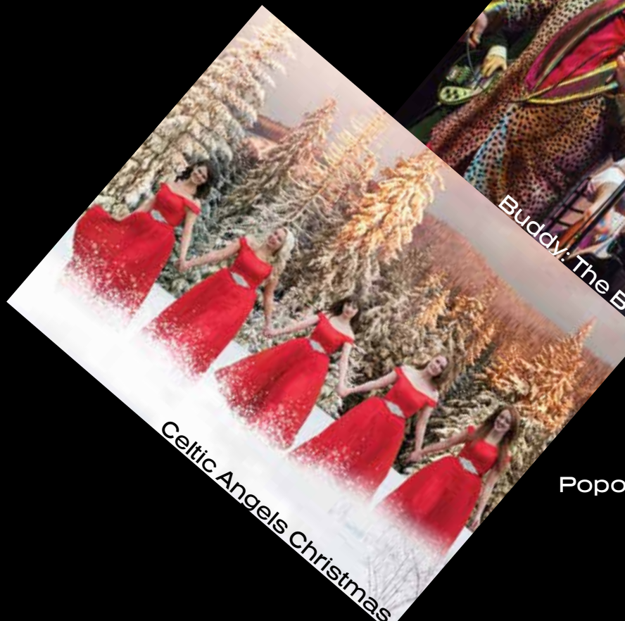
Celtic Angels Christmas

The “World’s Most Successful Rock ‘n’ Roll Musical” continues to thrill audiences around the world. Viewed by more than 22 million people worldwide, BUDDY opened in London’s West End in 1989, and has been seen on Broadway, throughout Canada, the U.S., Australia, New Zealand, Japan, Germany, Scandinavia, South Africa, the Netherlands and Singapore; winning numerous awards along the way. Buddy tells the story of Buddy Holly through his short yet spectacular career, and features, the classic songs, “That’ll Be the Day,” “Not Fade Away,” “Oh Boy,” Ritchie Valens’ “La Bamba,” The Big Bopper’s “Chantilly Lace” and many more! This show is just Peggy Sue-perb!