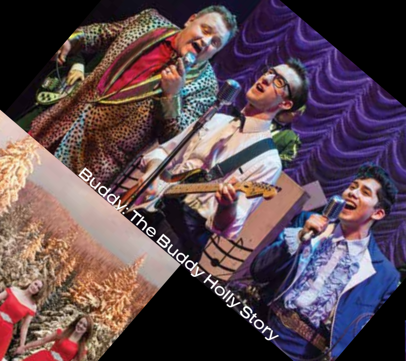
Buddy: The Buddy Holly Story