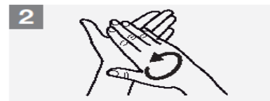
2 Rub hands palm to palm;