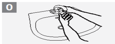
0 Wet hands with water;

⌚ Duration of the entire procedure: 40-60 seconds