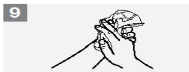
9 Dry hands thoroughly with a single use towel;