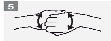
5 Backs of fingers to opposing palms with fingers interlocked;