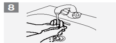
8 Rinse hands with water;