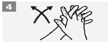
4 Palm to palm with fingers interlaced;