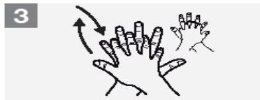
3 Right palm over left dorsum with interlaced fingers and vice versa;