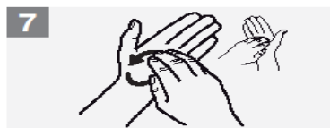
7 Rotational rubbing, backwards and forwards with clasped fingers of right hand in left palm and vice versa;