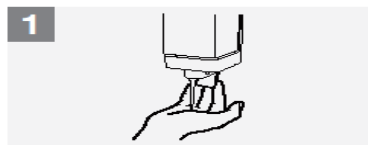
1 Apply enough soap to cover all hand surfaces;