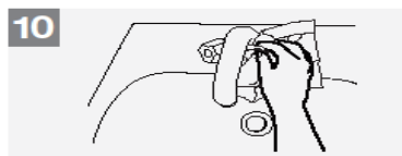
10 Use towel to turn off faucet;