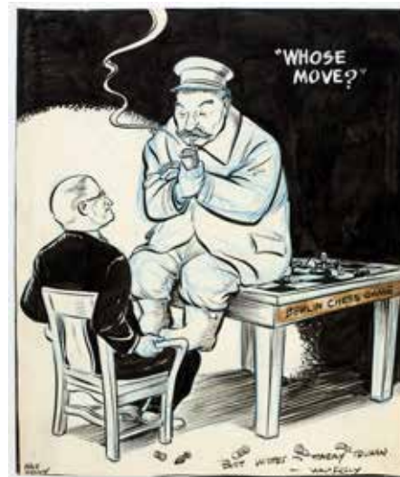
The 1948 political cartoon showed Josef Stalin seated on a table marked “Berlin Chess Game.” Stalin attempted to remove western influence in West Berlin, an area situated in communist East Germany. Truman’s and Stalin’s actions were depicted as a game of chess between two nations vying for dominance.

Consider the many different topics surrounding the Cold War (1947–1991). The Cold War exposed many social and cultural issues in the Soviet Union and the United States. Students might explore the Berlin Blockade (1948-1949), the Cold War's first crisis. Soviet Premier Josef Stalin blocked U.S., French, and British railway, road, and water access into West Berlin, hoping the western powers would surrender the city. What was the initial impact of this action? How might the events have launched the U.S. and its allies into another war? How did this crisis affect the diplomatic relationship between western powers and the Soviet Union? Students might explore other Cold War topics such as the Truman Doctrine (1947), the Korean War (1950-1953), the Kitchen Debates (1959), or the Cuban Missile Crisis (1962). Who was involved? Were these events instances of successful diplomacy, or were they diplomatic failures? How did their success or failure affect the relationship between the Western and Eastern blocs during the Cold War?