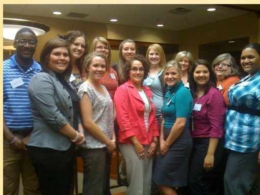
AAFCFS Fall Leadership Conference