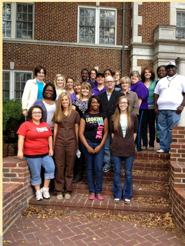
October , 2011, AAFCS meeting