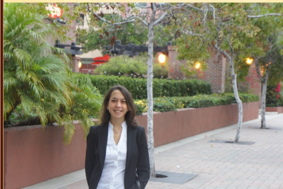
Ready for the sessions!