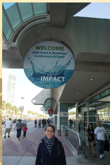
Make an IMPACT!