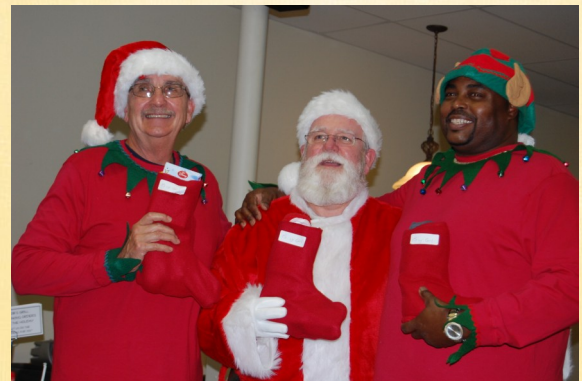
Santa's Helpers showing off three of the 178 CASA stockings made and filled by the FACS Department.