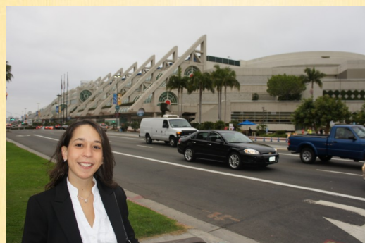
Convention Center in San Diego