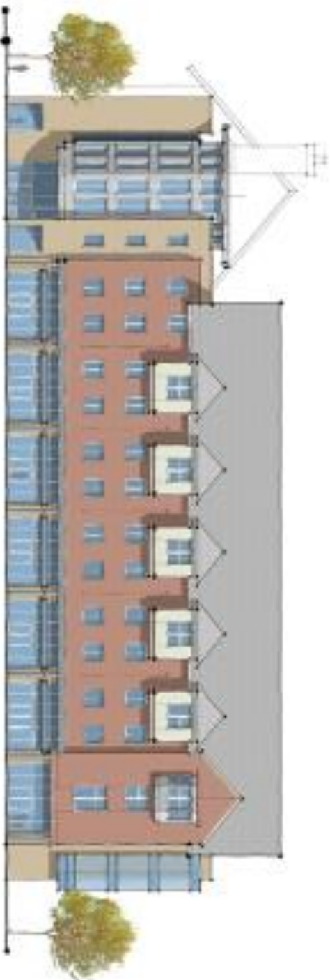
Donaghney Street Elevation (West)