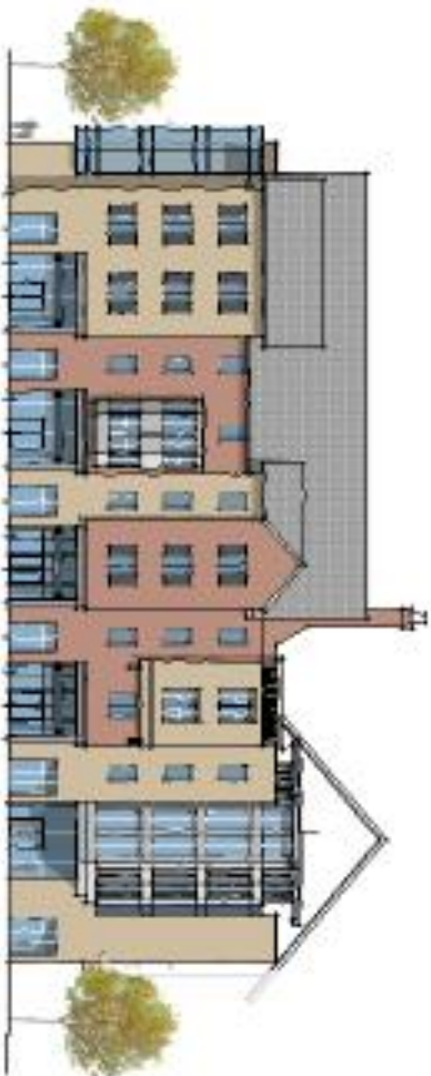
Bruce Street Elevation (North)