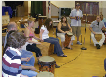
Working on a Cuban piece