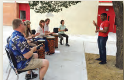
Breakout group micro teaching

The WMD: Curriculum Update course is an optional course that falls somewhere between Levels 1 and 2. After taking Level 1, you may either take this course or go right to Level 2.