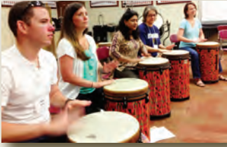
Level 1 Class