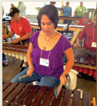
Hot Marimba Class

creating a high-level performing group at your own school. Orff teachers will love it — pieces are playable on Orff xylophones! Class limit: 30. Marimbas are provided for the class with help from teachers and Bourne Marimbas, Bellingham, WA. ( http://www.bournemarimbas.com/ ).