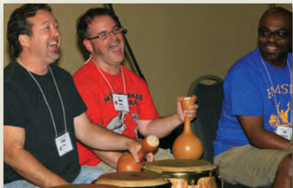
Adenkum gourd practice