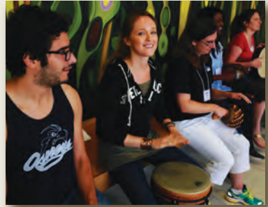
Rhythm Complements Small Groups

Daily classes include large group instruction, small group interaction with guided micro-teaching/leading, and small group ensemble creation/ improvisation. You will learn how to drum, sing, move, play xylophones and recorders, and teach and lead others. You will learn how to integrate drumming into other school and life experiences, and you will also receive supplemental songs and leader strategies not published in the original curriculum. Training in West African and Caribbean dance will be offered at some locations.