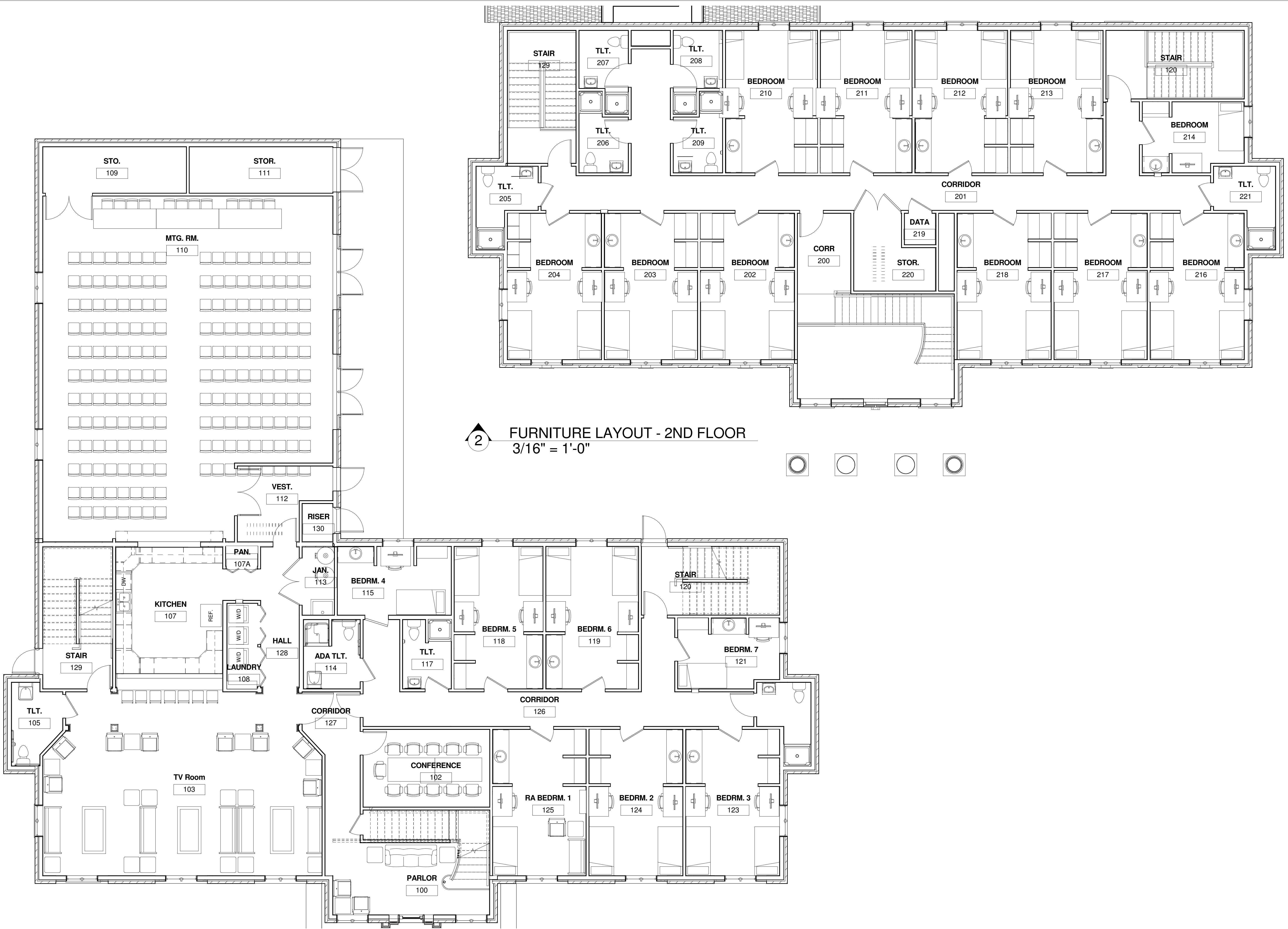
2 FURNITURE LAYOUT - 2ND FLOOR 3/16" = 1'-0"