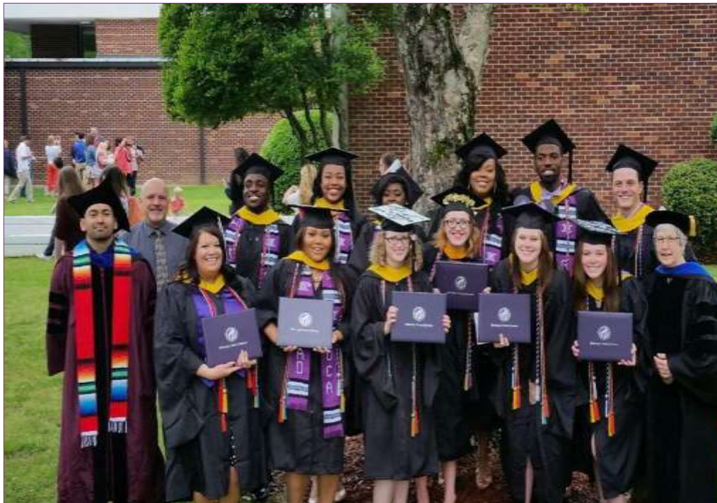
UCA CSPA CLASS OF 2016

There have been quite a few changes within the University of Central Arkansas CSPA program this year, but with each change we have moved closer to our goal of delivering an education to students that inspires them to make a difference in the lives of others.