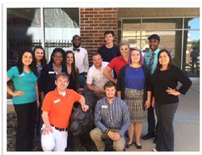
Future CSPA Class of 2017

This program has educated me, enhanced my skills, encouraged me to step out of my comfort zone, and given me the confidence to face any challenge head on, loosening the knots of doubt in my stomach along the way. What I appreciate most about UCA's CSPA program is that in only a matter of months, it has already provided me with tools, knowledge, and experiences to loosen the knots of other worrisome college students and support their success for years to come.