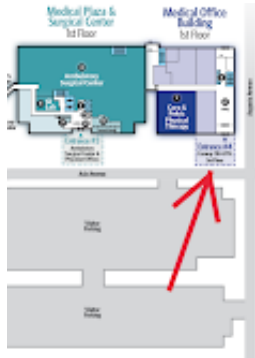
CRHS Map - Bldg 4.PNG 43K