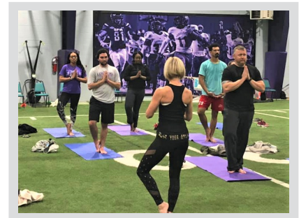
Yoga instructor leads group in Tree Pose

The Exercise & Sport Science Exercise Science Club sponsored the First Annual “Hauling Eggs 5k Fun Run and Yoga Event” on April 13, 2019. The club raised $1,500 that will provide financial assistance for students to attend a national conference later this year.