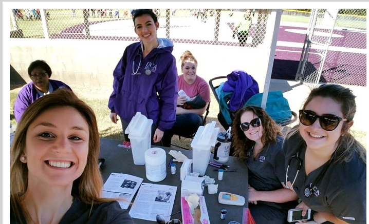
School of Nursing Students provided screenings at UCA's Amigo Cup Soccer Challenge.