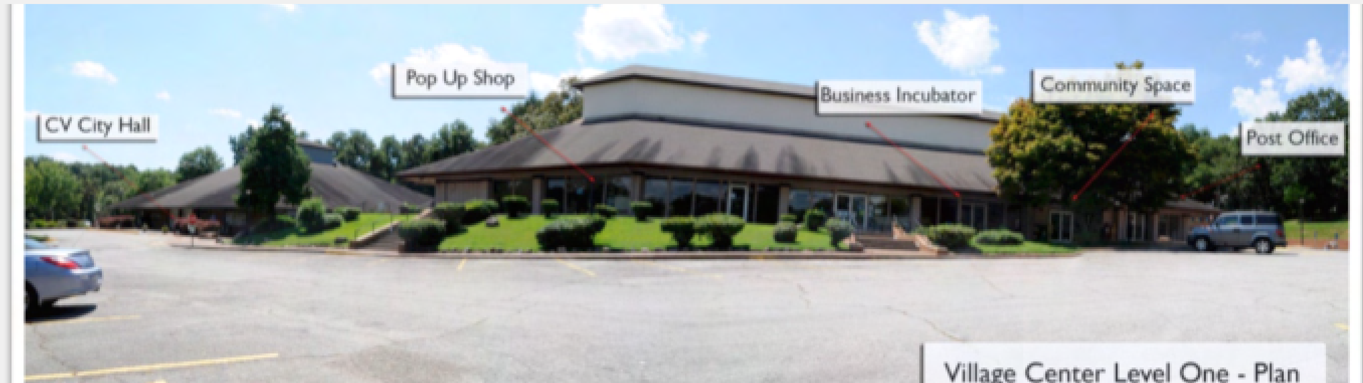
Village Center Level One - Plan