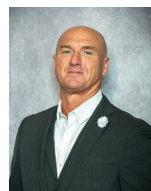
Mayor David Faulk City of Prairie Grove