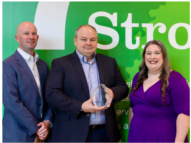
Friend of CDI Arkansas Electric Cooperatives