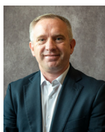
Mayor Nathan See City of Pea Ridge