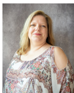
Trish Ouei Beaver Water District