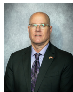
Mayor Troy Reed City of Elkins