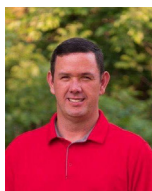
Mayor Chris Moore City of Lowell