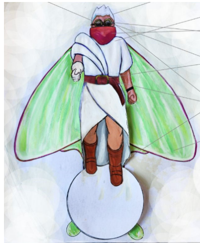
Luna, the Eclipse Superhero