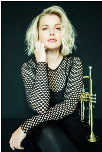
Bria Skonberg