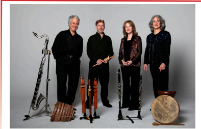
The Hevreh Ensemble Chamber Musicians