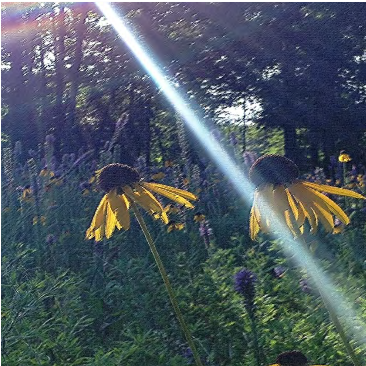
Sunbeam at the Nature Reserve (2015)