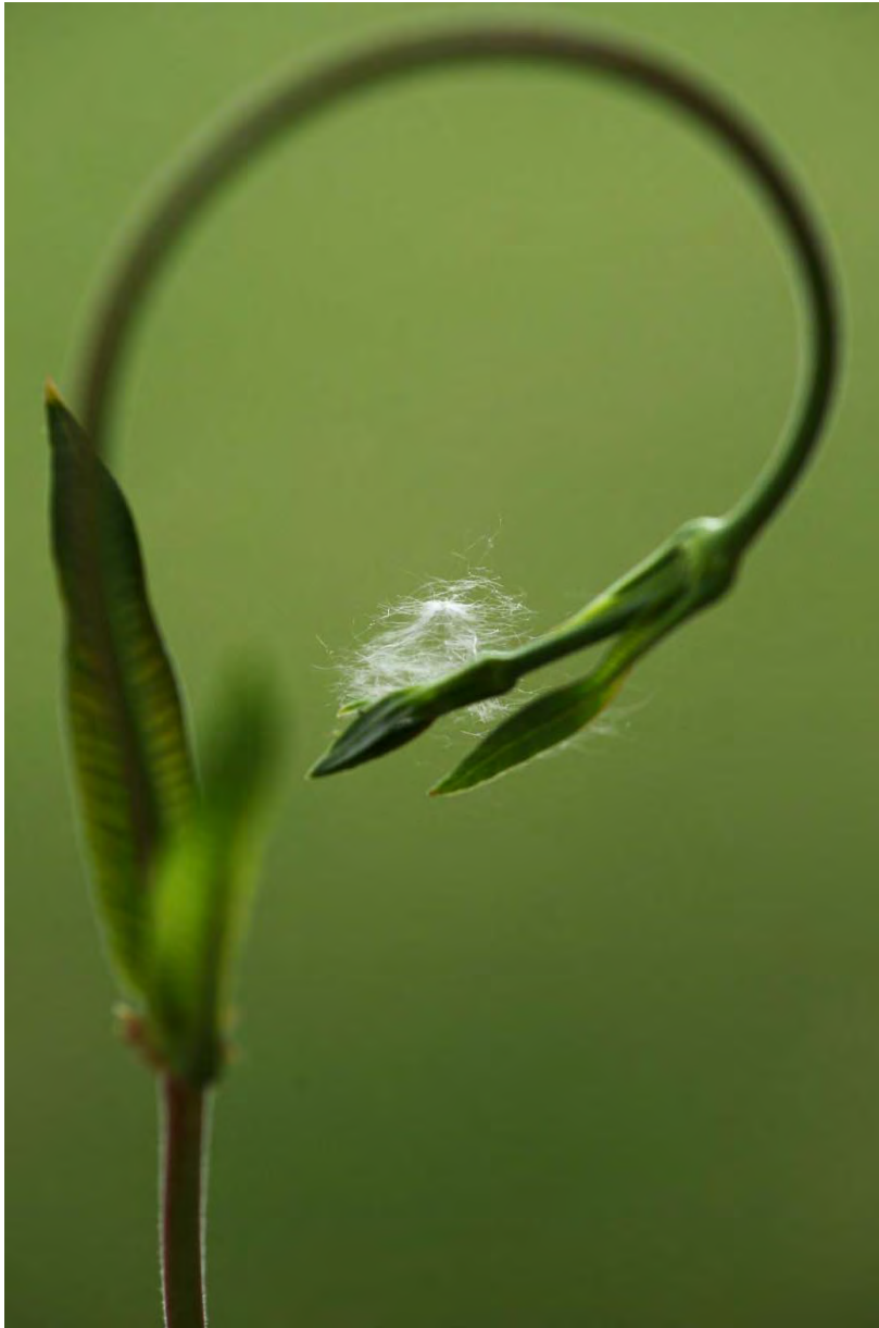
In the Beginning (2014)