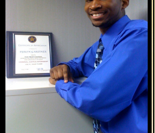
U.S. Postal Inspector Intern