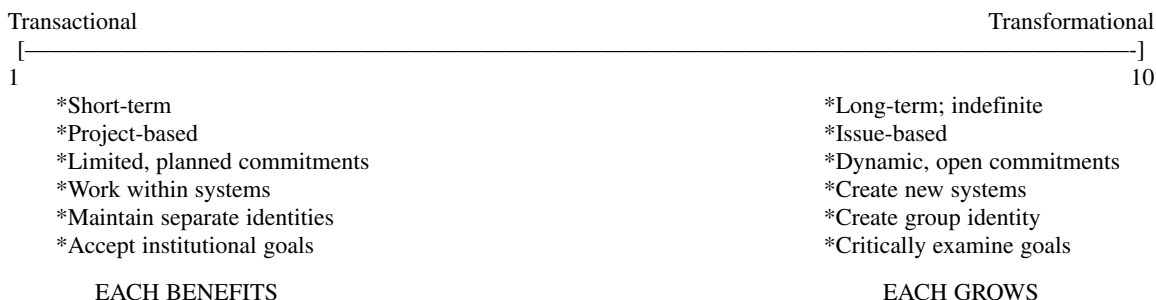
Figure 2 Preliminary Continuum

When constructing the nine items, variable numbers of options were included to capture different possibilities and nuances across the continuum for a particular attribute. The uneven number of response choices for different items was shaped by the desire to present respondents with reasonable choices spanning the conceptual continuum. Some analyses are based on these raw score responses, which were obtained by summing responses to the nine items and finding the mean score for each research participant. Despite the unequal number of response categories, summing or averaging these responses across items