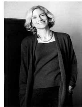
Dr. Martha Nussbaum University of Chicago Ernst Freund Distinguished Service Professor

followed Dr. Nussbaum's lecture. In many ways, the event exemplified UCA's commitment to liberal arts education and critical thinking.