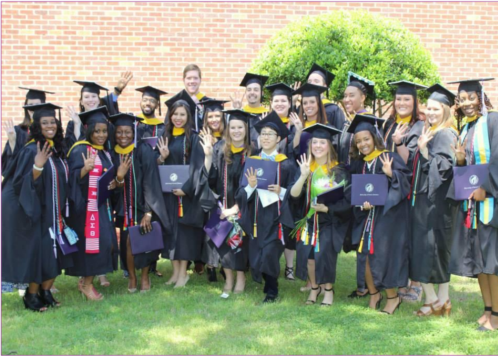
UCA CSPA CLASS OF 2015