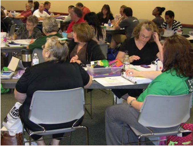
Algebra I Teachers at UCA Workshop