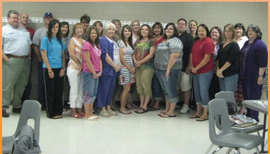
Teachers at the Nashville Workshop